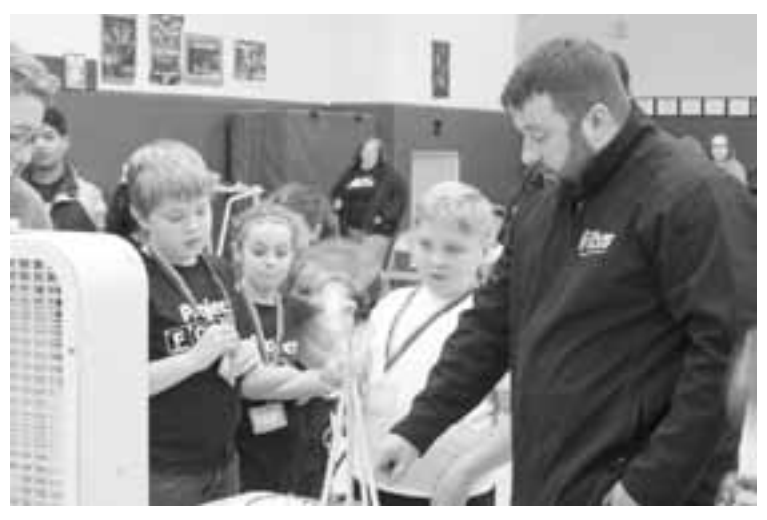
Students test their wind-powered turbines for output voltage

Students had the goal of visiting all exhibits during this busy time, and students who attended enough events were entered into a raffle for some really great prizes. Top prizes included a camera ready drone, and some engineering based science kits. Each school brought home medals, and the event was a huge success! We look forward to a bigger and better STEAM Competition for 2018!