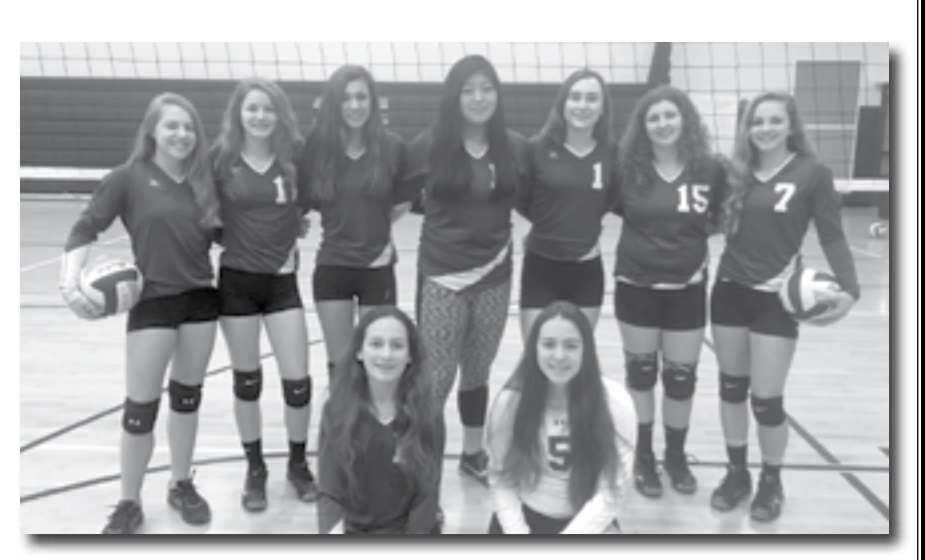
The 2017 8th grade Volleyball team completed their perfect season by winning the 2017 season-ending MSVB tournament!

Funded in part by a grant from Fremont Area Community Foundation.