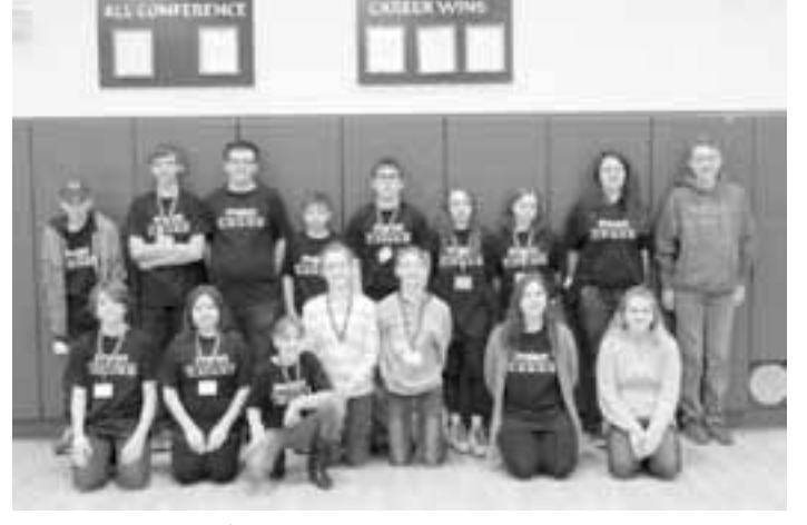
Students from Hesperia who participated in the STEAM Challenge