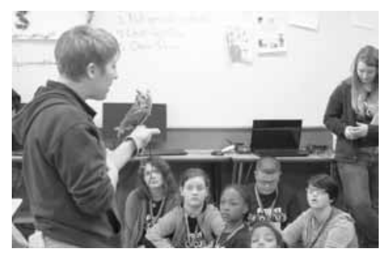
John Ball Zoo showcasing some of their traveling exhibits