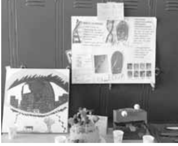
Just a small portion of the art that was brought to the competition