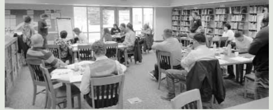
March 25<sup>th</sup> Strategic Planning Day

I truly appreciate the dedication, commitment, and time of these volunteers as we move this plan forward for the next three to five years.